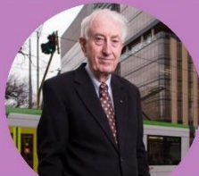
Laureate Prof Peter Doherty Doherty Institute